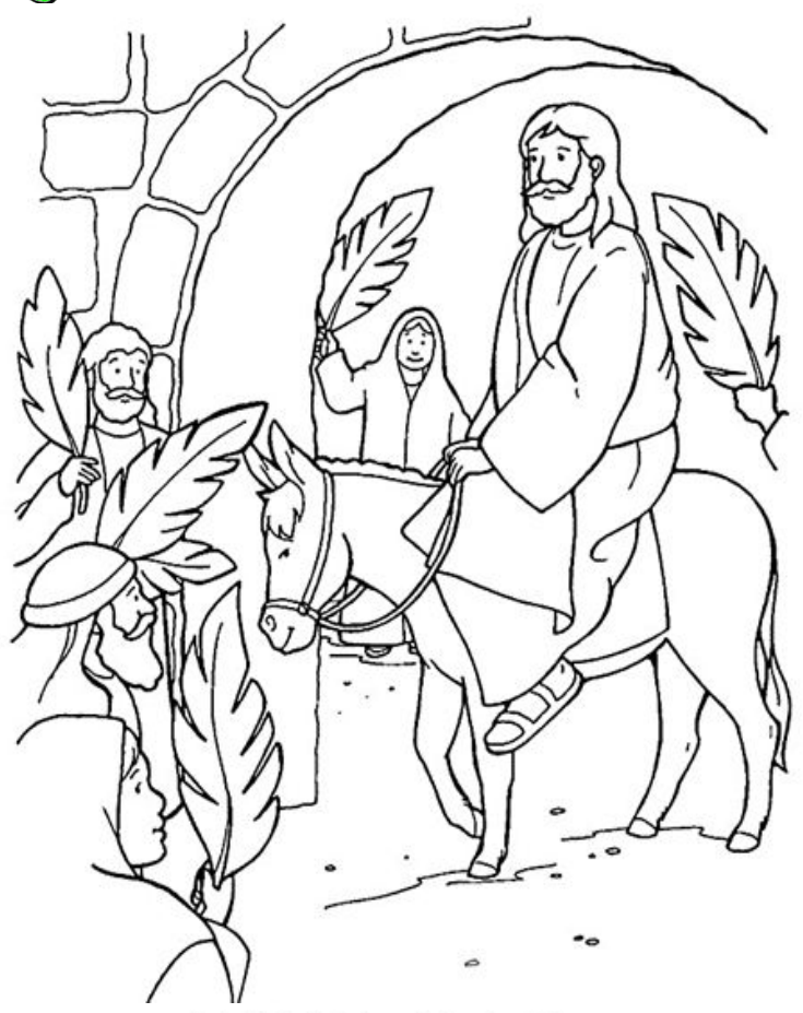
Church of Saint Leo the Great - www.stleothegreat.com/childrens-corne