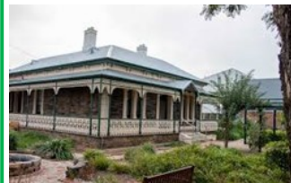
Original St Joseph's Convent Hindmarsh...presently Sacred Heart Parish Office