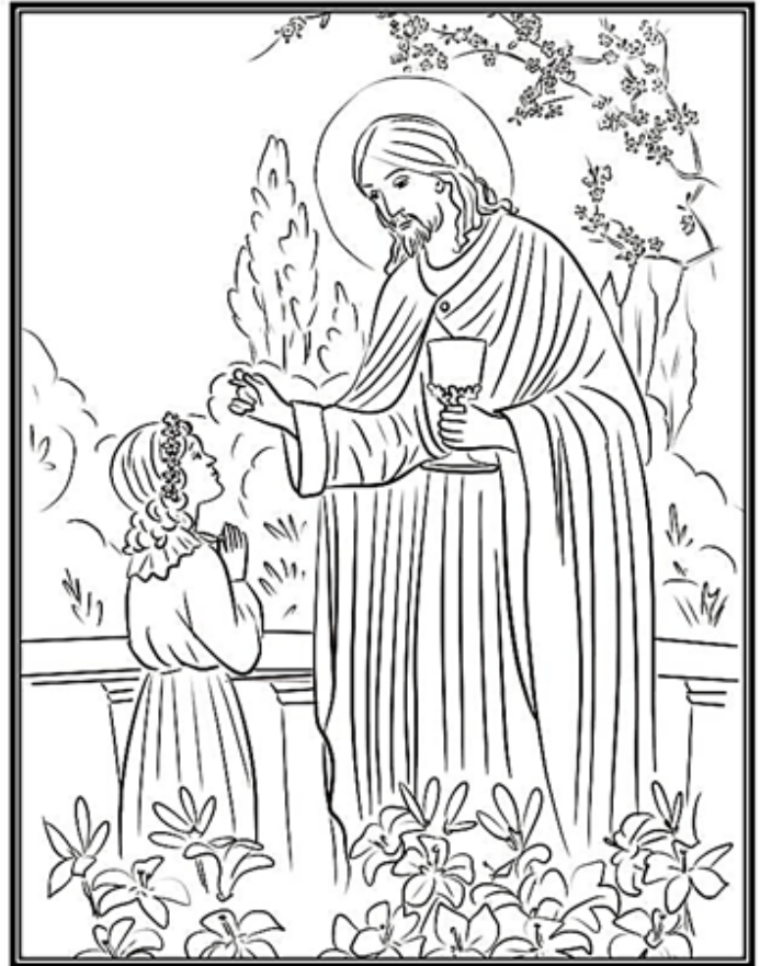
Church of Saint Leo the Great www.stleothegreat.com/childrens-corner

"ಸಕ್ಕಡ್ ಸಾಂಗಾತಾ ಮೆಳ್ಳಾಂ, ಮರಿಯೆಕ್ ಹೋಗೊಲ್ಲಯಾಂ"