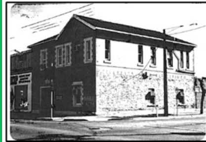
Josephite Convent: corner Port Rd and Chief St Hindmarsh

Later a Convent was built on the corner of Port Rd and Chief St at Hindmarsh and space for secondary students built behind it. The median strip in Port Road became the play space for the students! (Not the busy thoroughfare of today!) Mary MacKillop was a frequent visitor to the school in its early days.