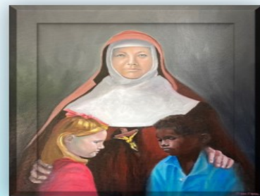
© Jacob Stengl—RIP 2022 Used with permission