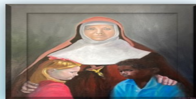
© Jacob Stengl—RIP 2022 Used with permission