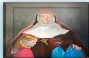
© Jacob Stengl—RIP 2022 Used with permission